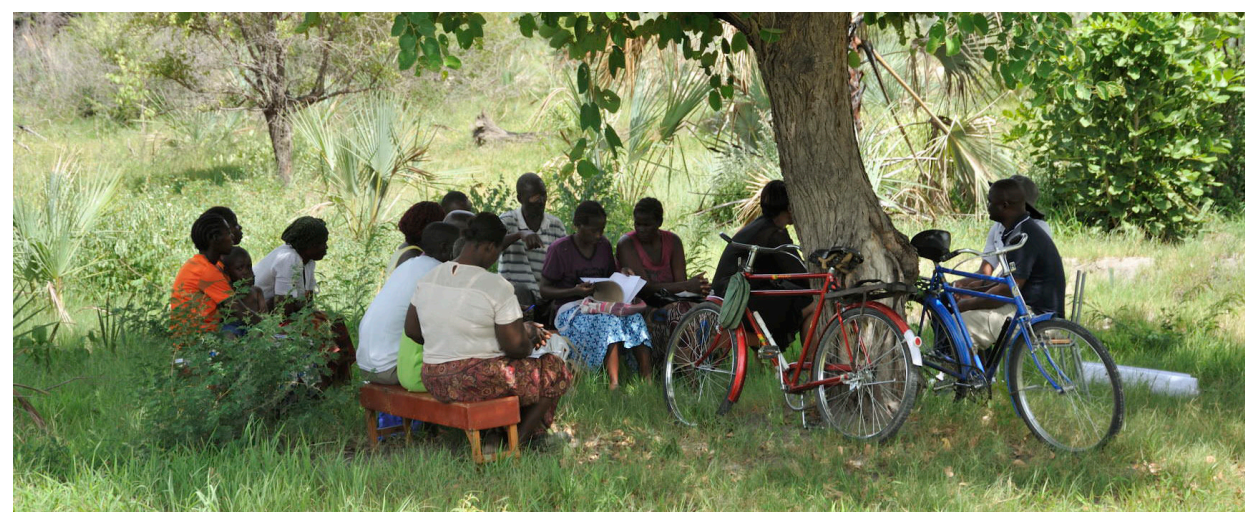
OVERALL COMMITMENT AND GOOD GOVERNANCE 2019