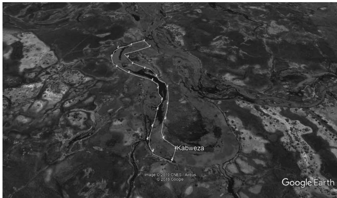
Figure 2: The boundary of the Kabweza Fisheries Reserve in the Lusese Conservancy. (Perimeter 4.9km) (© 2018 Google LLC.).